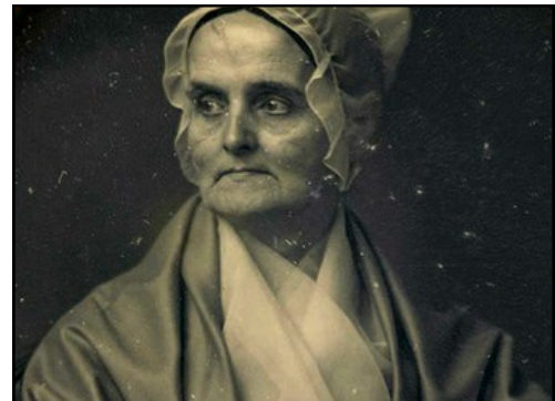
"If our principles are right, why should we be cowards?" Lucretia Mott