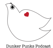
Dunker Punks Podcast